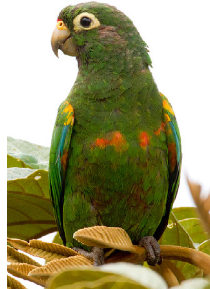
Santa Marta parakeets in the Sierra Nevada de Santa Marta in Colombia.

1% for the Planet member companies as well as foundations and individuals can contribute to the Fund. Special thanks to all of the Fund's 2015 supporters — including the The Wall Group and Caudalie — who provided critical start-up contributions in 2015!